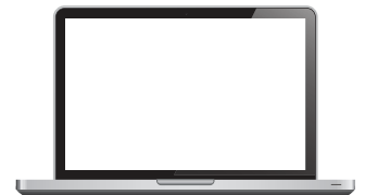
Laptop | PC with HDMI port